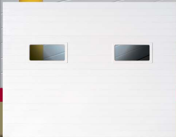
9' x 7' 3216 white with optional 24" x 12" windows.